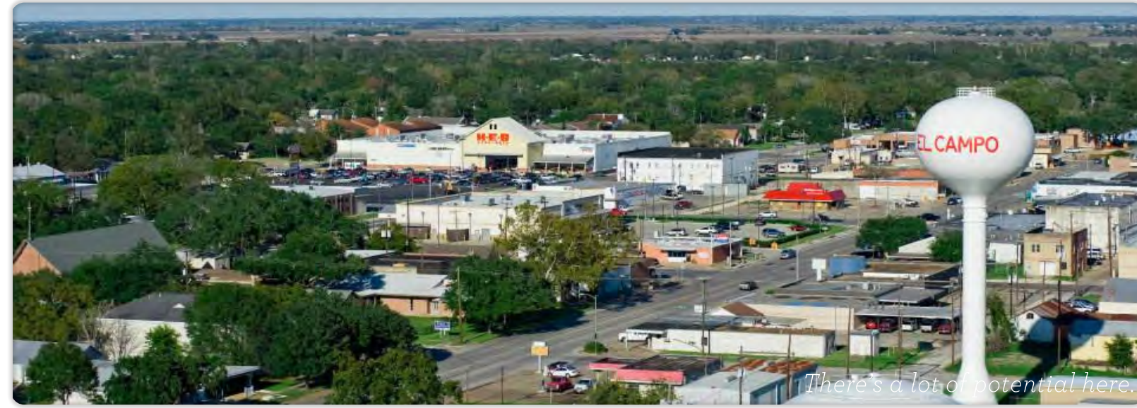
There's a lot of potential here.