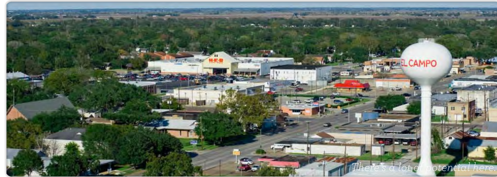
There's a lot of potential here.